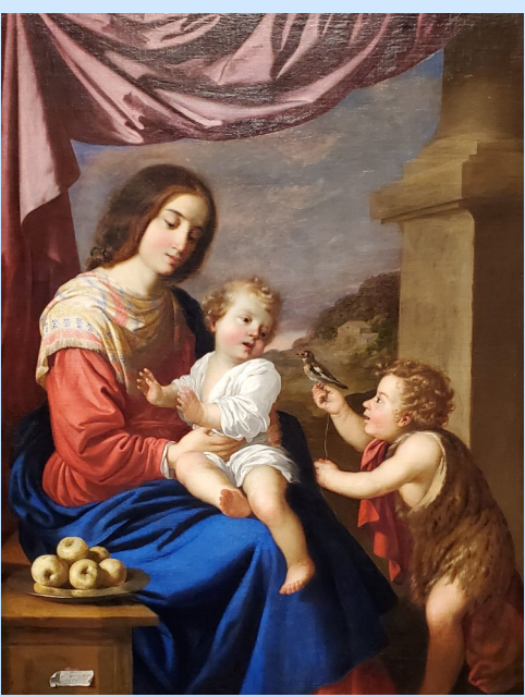
Madonna & Child with the Infant St. John the Baptist by Francisco de Zurbarán, recently featured at the San Diego Museum of Art in the "The Golden Age of Spain" exhibit

Our goal is to educate, empower and provide oppor-