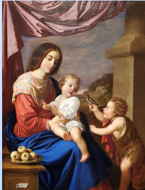
Madonna & Child with the Infant St. John the Baptist by Francisco de Zurbarán, recently featured at the San Diego Museum of Art in the "The Golden Age of Spain" exhibit

We are so grateful and blessed for the many committed partners within the CIH community that provide for our women and children. You expand the possibilities of services and honor Our Lord by your faithfulness and generosity.