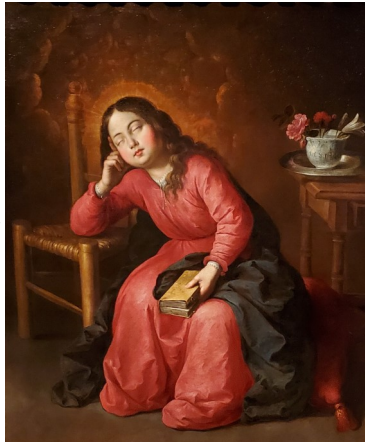
The Virgin Mary as a Child Asleep by Francisco de Zurbarán

Like Gertrude von Le Fort in her book The Eternal Woman , he uses the image of the veil, which covers the mystery of this domain which can only be entered when God gives permission, and only in such a way that a person “surrenders himself without reserve to the beloved, but not to the specific quality of sex.” Most of us intuitively understand that even in marriage, and even within a sacramental marriage, a husband and wife can use each other. We understand implicitly how terrible this is and what a burden it becomes, but it is not always easy